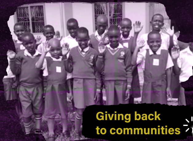
Giving back to communities