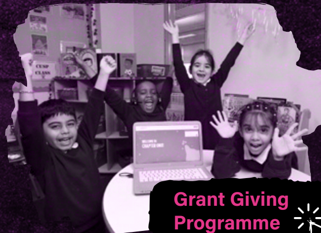
Grant Giving Programme