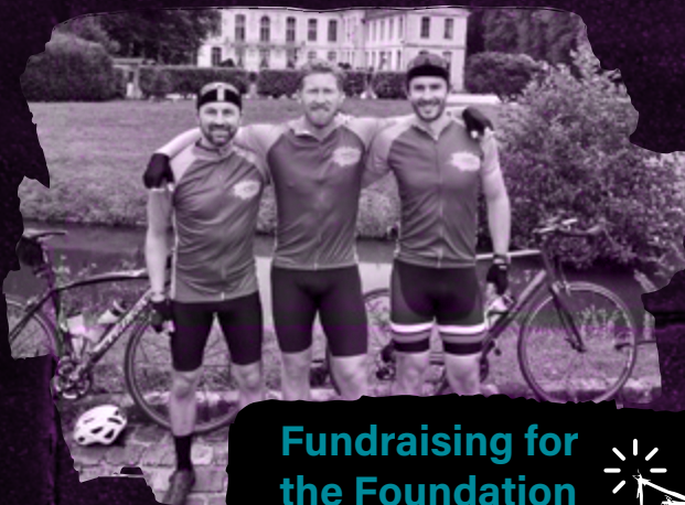
Fundraising for the Foundation