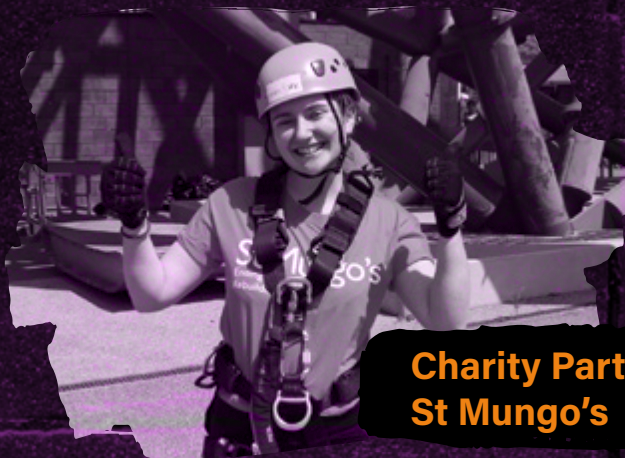
Charity Partner St Mungo's